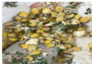
Good til the last spoonful!